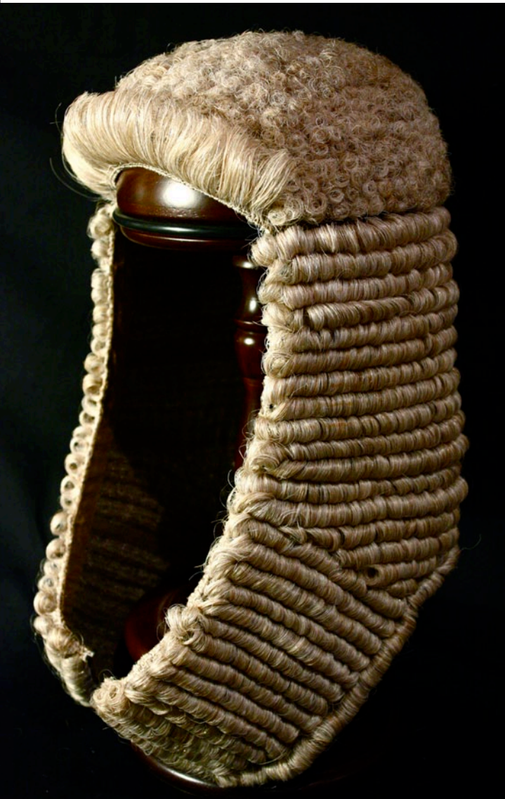
The full-bottomed wig is worn by judges on ceremonial occasions.